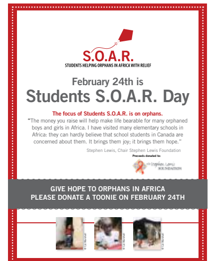
Students S.O.A.R. Day Poster